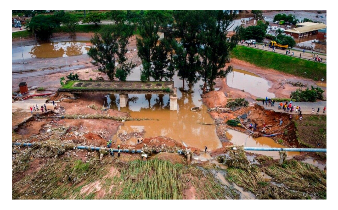
This picture shows damages from floods, in South Africa, which occurred in April 2022 – in KwaZulu-Natal Province.

According to Levey (2022), at least 435 people died and damages to property amounted to around R18,779,650,000 billion as the result of these floods in KwaZulu Natal. Over and above the challenges of ceaseless rainfalls, of late, extreme cold weather patterns are also being experienced, which of course is a concern in poor communities. The results of cold weather are also frustrating because people from the working class background and poor are always affected by such weather conditions. It is an uncontested historical reality that when extreme cold weather conditions hit the ground the subalterns often lost their lives as the result of either the exploding of the gas heaters or of carbon dioxide emitted by the burning of the coal. In the past few weeks, South Africa, country-wide had gone through unimaginable cold weather. Kempen (2022:52) argues that weather patterns have been changing drastically during the past few years, hence the inconsistencies in temperatures. This calls for society to reimagine and explore new ways of living and how agricultural activities are supposed to be handled now and in the foreseeable future. Perhaps by observing the primitive ways of agrarian activities, the current incomprehensible situation could be resolved by reapplication of the traditional ways of tilling the land and avoiding chemically induced fertilisers.