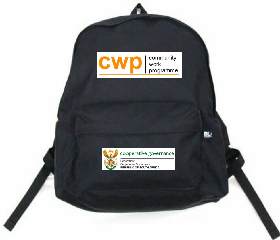
FRONT OF BACK PACK