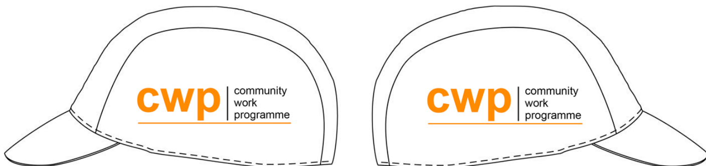
BOTH LEFT AND RIGHT SIDE OF CAP

The left and right hand side of the caps need to have the CWP logo embroidered or screen printed on in full colour.